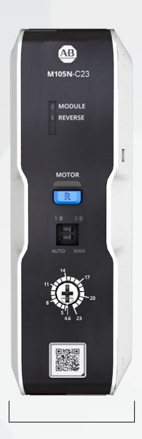
Up to 23A